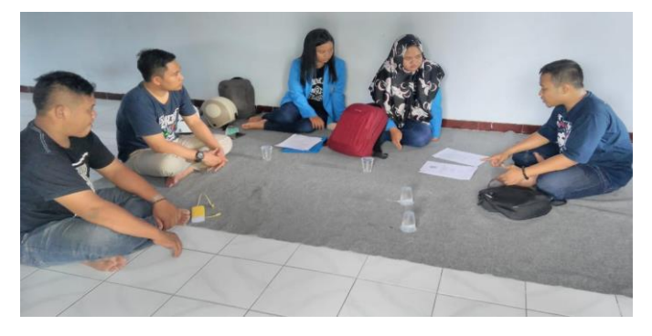
Figure 3. Observation and Situation Analysis Stage

Implementation of PKM-M activity started from observation to Shelter Rumah Hati Jombang on April 13, 2018. Observation activity was done to see the situation of children and adolescents who are in Shelters Rumah Hati in Jelak Village, and ask permission to conduct PKM-M activities there with the title "Online business training to children and teenager Shelter Home for Former Prisoners in Hamlet Jelak Ombo Jombang" which aims to facilitate the team in planning the program PKM devotion to be implemented.