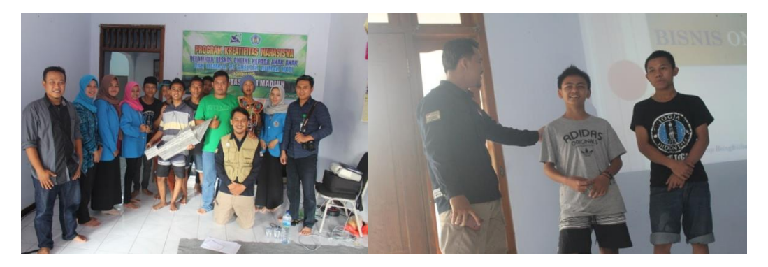
Figure. 5 Stage Training and Assistance