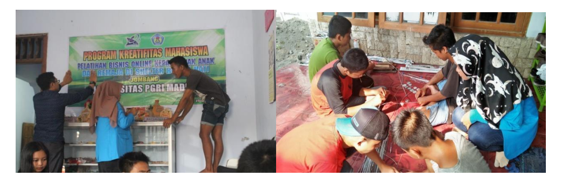
Figure 4. Training Preparation Activities